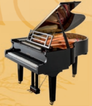
Mod. 179 - Dynamic II