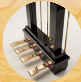
Pédale Harmonique for all grand pianos