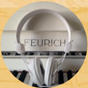
Silencer Systems for all models