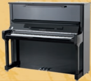
Mod. 133 - Concert