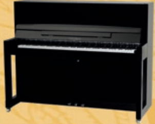
Mod. 115 - Premiere