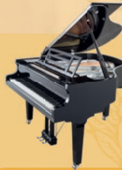
Mod. 162 - Dynamic I