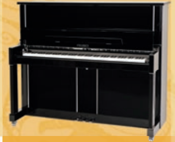
Mod. 125 - Design