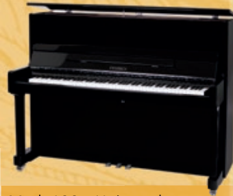
Mod. 122 - Universal